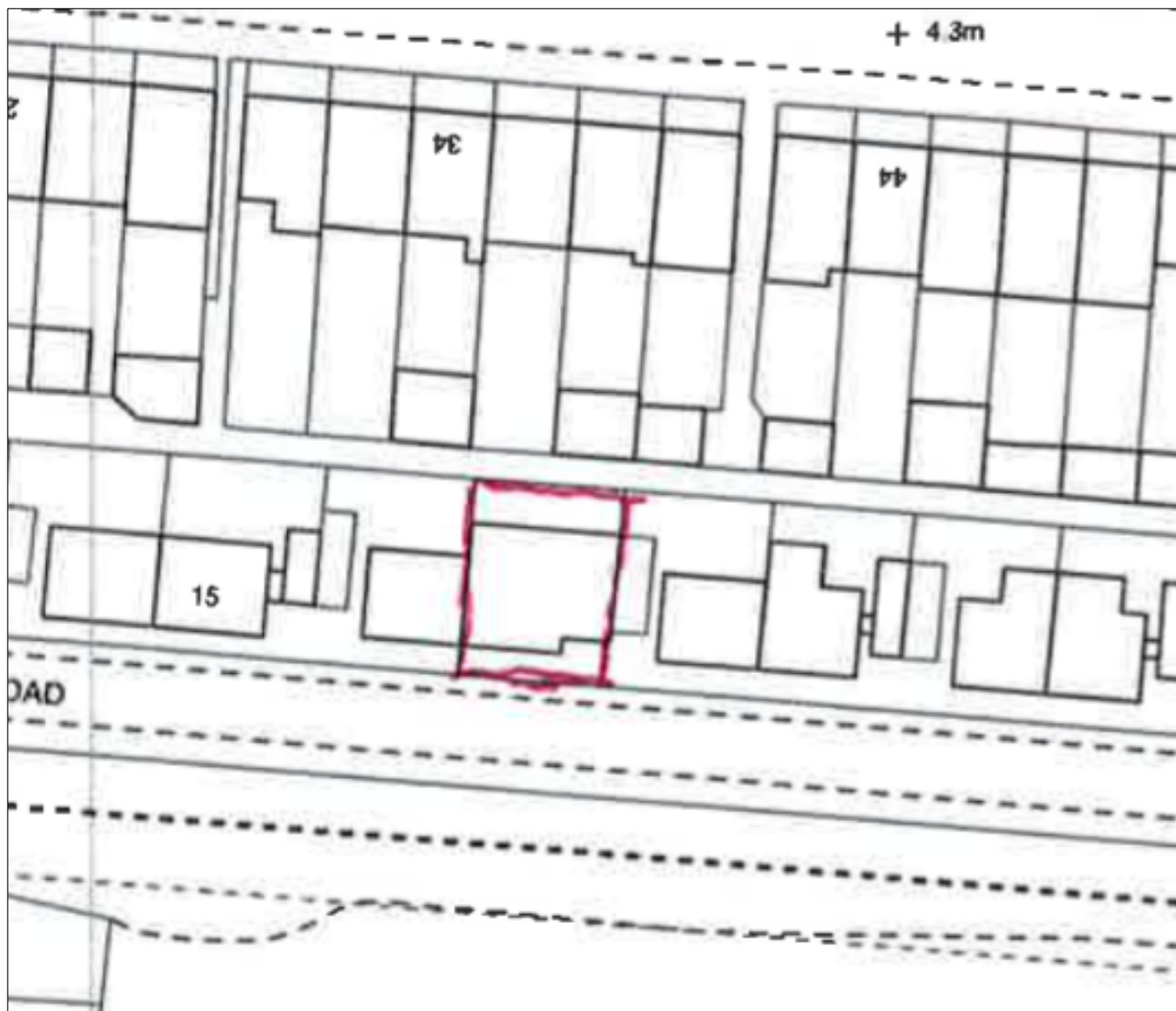
Figure 1 Site Location Plan