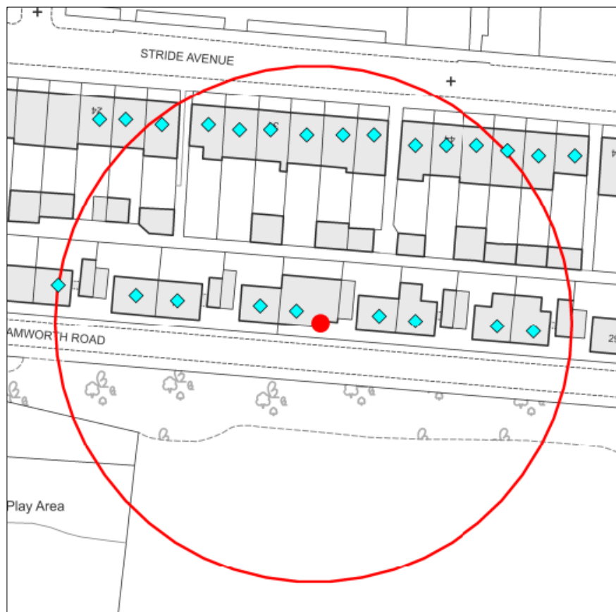
Figure 2 No existing HMOs within 50m of the application site